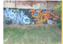
Graffiti along the Greenway