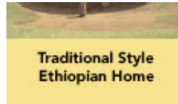
Traditional Style Ethiopian Home

ever-changing coffee world. Many connoisseurs consider the coffee that is grown in this area to be the finest in the world. Rugged highlands with an abundance of seasonal rainfall make it an ideal location for the coffee plant to grow. We arrive into Yirgacheffe a little after the six o'clock hour. Checking into the local hotel brings us a friendly welcome, and an invitation to enjoy dinner there.