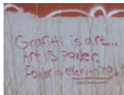
Graffiti is Art... Art is power. Power is everything